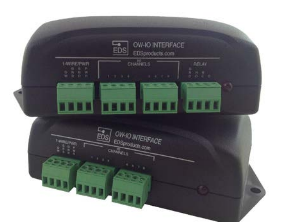
OW-IO-AI8-420 Eight Channel Input With & Without Optional Relay