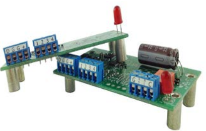
OW-IO-AI4-420 Four Channel Input With & Without Optional Relay

The nearly instantaneous automated responses made by the LED and optional relay allow appropriate reactions (activate fan/alarm siren/etc.) to occur before the monitoring application is even aware of the alarm. The 1-Wire Analog Input has been designed to simplify the reading and controlling process; and therefore any general purpose 1-Wire host adapter is able to read the analog points.