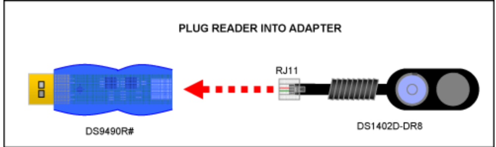
Figure 11. Connect the reader to the adapter.