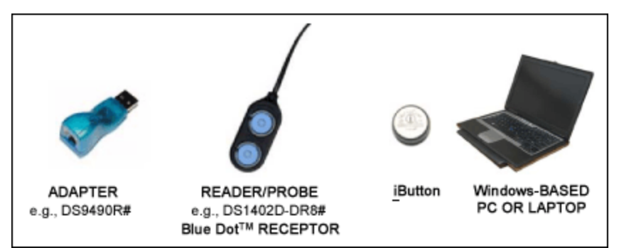
Figure 1. Required setup components.

Maxim provides two iButton kits that include the adapter, reader, and iButtons for evaluation: